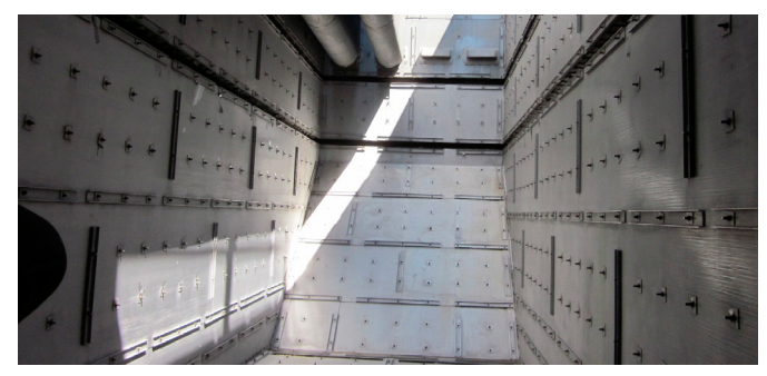
The Dürr Universal team knows how to spot problems before they become critical, which serves as a large help to removing potential long-term issues.