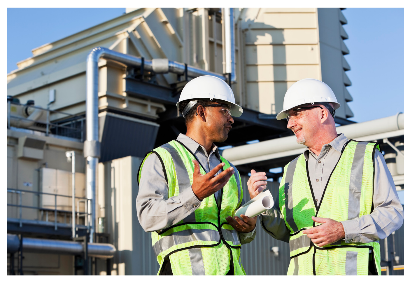
Performing regular maintenance, updates during scheduled outages, and unexpected equipment replacements are simply the nature of the power generation business. Dürr Universal makes the difference in minimizing the disruptive nature of these activities.

We leverage our depth of capabilities to tackle any project, anywhere. From applications of five megawatts to several hundred megawatts, we enable gas turbine power operators to comply with regulations for clean air and noise abatement, safely and efficiently. Our goal is a safe trouble-free project.